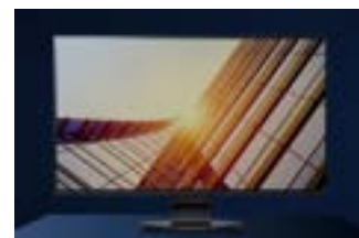
In the evening