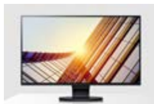
During the day

Of course, you can also continue to configure the monitor manually. EcoView Index is used for orientation on how environmentally friendly and economical your settings are.