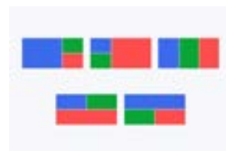
Picture-in-picture layouts with 3 picture signals