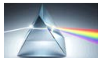
Look-Up-Table with 8 bit