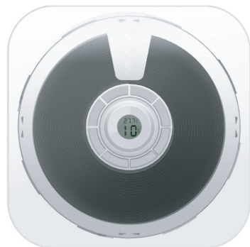
Filament Mate™ Spool rack | Waterproof | Dust-free